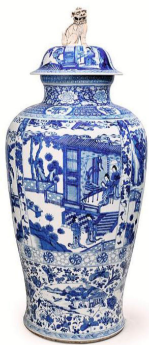
Jorge Welsh Works of Art boasts magnificent Chinese porcelain.

bong (b. 1974) whose landscapes are influenced by Five Dynasties artist Dong Yuen (c. 934-962).