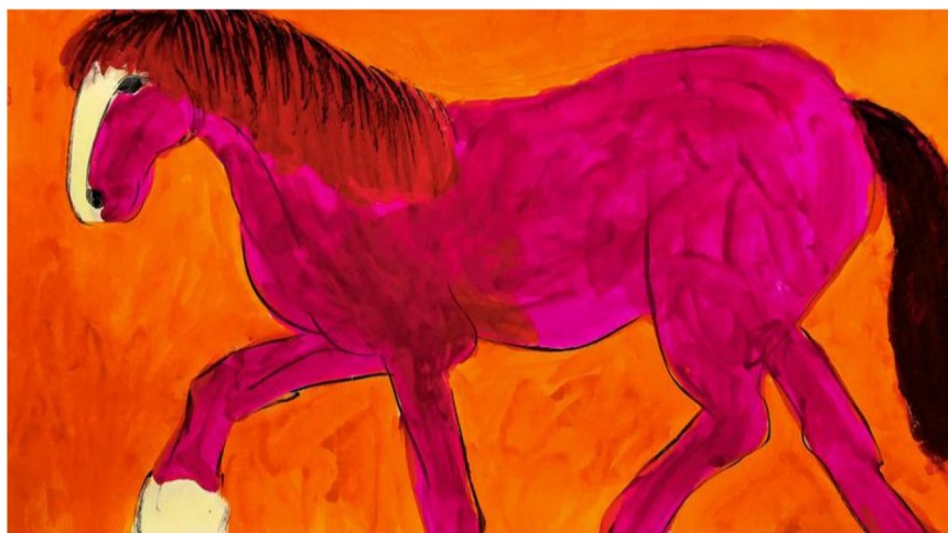
Hong Kong gallery Alisan Fine Arts has Walasse Ting's 'Pink Horse' in Chinese ink and acrylic on rice paper.

Gladwell & Patterson of London returns with a stunning selection of Impressionist and modern paintings by masters including Claude Monet, Gustave Loiseau and Salvador Dali. Galerie Dumonteil of Paris, Shanghai and New York, as usual presents the finest art on animal themes, with highlights by Diego Giacometti and Rembrandt Bugatti. Shibunkaku, of Kyoto,