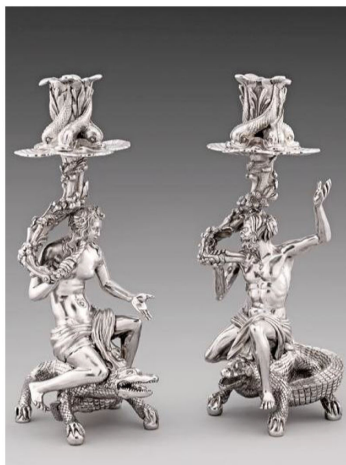
Rossi & Rossi features rare paintings, sculptures and ritual objects from China, India and the Himalayas (left), while Koopman Rare Art showcases fine antique silver.