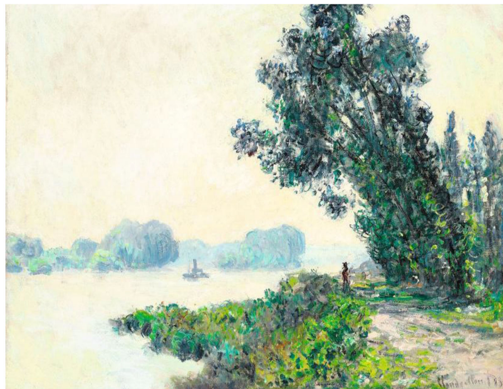
Gladwell & Patterson, of London, has a stunning selection of works by Impressionists, such as Claude Monet.