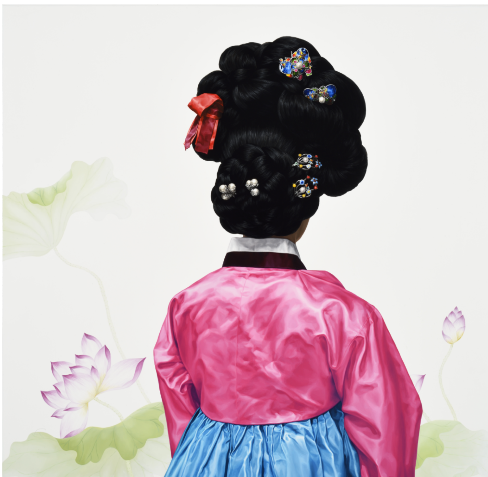
Jeong Myoung-Jo, Soluna Fine Art