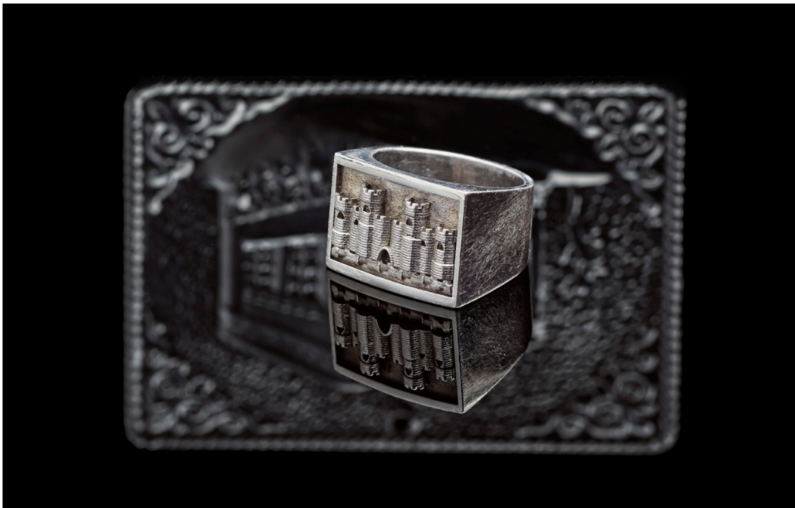
Men's Rings, Yves Gastou Collection, L'ÉCOLE Asia Pacific, School of Jewelry Arts

Fine Art Asia 2022 will also reunite high profile education partners and will host a diverse Academic Programme of lectures and seminars with about thirty experts different art fields, to strengthen discussion and interaction between scholars, galleries and collectors. The full programme can be found here .