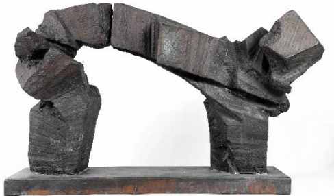
Ju Ming (b. 1938) Taichi Series Undated Bronze Edition 5/20 L. 111.7 x W. 41.3 x H. 71.2 cm Hanart TZ Gallery, Hong Kong

Fine Art Asia offers a unique opportunity to view, appreciate and acquire masterpieces of Impressionist and modern art, while the contemporary art section showcases works by acclaimed Asian, Chinese, Hong Kong and Western artists.