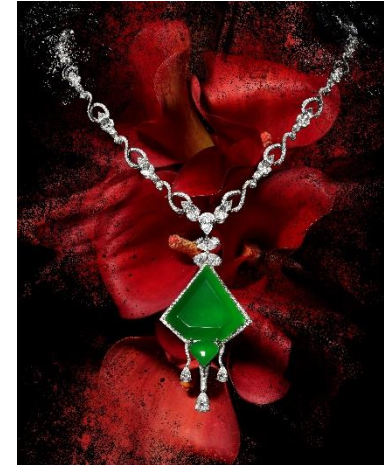
Jadeite plaque and diamond pendant necklace The largest jadeite measuring approximately 28 x 30 x 4 mm ILIA Jewellery, Hong Kong