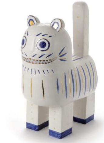
Lee Joonsung (b. 1974) White Tiger 2022 White clay 30 x 16 x 50 cm Korean Cultural Center in Hong Kong