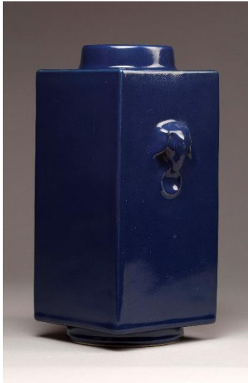
A sacrificial blue glaze “Zong” vase Qing Dynasty, Qianlong mark and period (1736-1795) H. 29 cm Ming Gallery, Hong Kong

Fine Art Asia brings together the elite of antiques galleries worldwide. Expert specialists from both East and West will present an unprecedented range of museum-quality artworks, ranging from ancient Chinese and Himalayan bronzes to Central Asian gold wares, Chinese porcelain and lacquer to furniture, textiles and works of art.