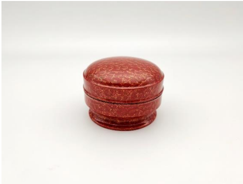
Gan Erke (b. 1995) Red-gold-patterned Xipi-lacquer small circular case 2019 Natural lacquer, ramie, ancient tile ash, mineral pigments and materials H. 5.2 x D. 7.2 cm The Gallery by SOIL, Hong Kong

With Craft and Design becoming regular exhibits in Fine Art Asia in recent years, the fair will dedicate a special section to this category in 2023, presenting national and international handicrafts that are in delicate design and created with exquisite craftsmanship.