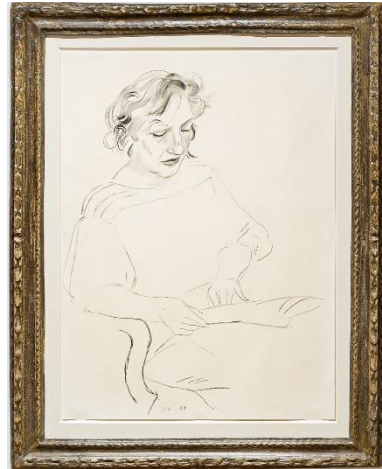
David Hockney (b. 1937) Celia 1984 Charcoal on paper H. 74.9 x W. 55.9 cm Tanya Baxter Contemporary, London/Hong Kong