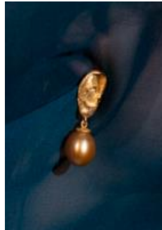
Joy BC (b. 1989) Listening Aid's (Golden Sounds) 2021 Recycled 18ct yellow gold and golden South Sea pearls H. 45 x W. 15 mm THE SHOPHOUSE, Hong Kong