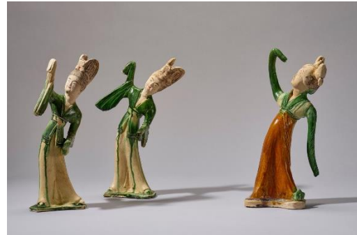
Sancai glazed pottery dancers (a set of 3) Tang Dynasty (618-907) H. 27 & 29 cm Lam’s Gallery, Hong Kong