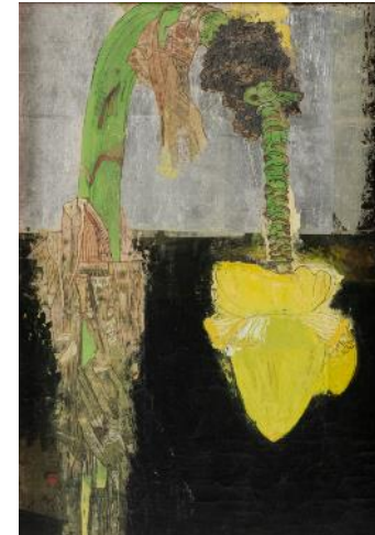
Kansuke Fujii (b. 1947) Banana 2022 Ink, colour and silver leaf, copper leaf, tin leaf on paper H. 60.3 x W. 42 cm Yumekoubou, Hong Kong/Kyoto